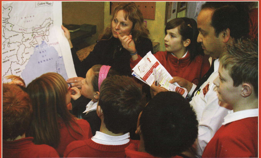
The Dil Raj owner points out to the children different parts of India where the foods originate from

At the end of their visit the kids were served up a delicious meal for them to enjoy.