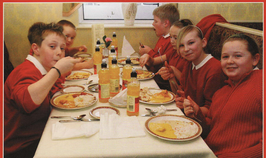
The Kids enjoy a delicious Indian meal at the end of their visit