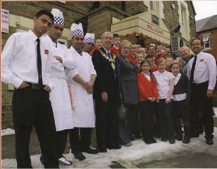
The Staff of Dil Raj welcome the Children and The Mayor and Lady Mayoress to the Dil Raj Restaurant